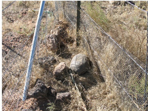
Figure 1. An adult Desert Tortoise ( Gopherus agassizii ) in an area where two fence lines met forming an acute angle. The angles of these fences seemed to cause tortoises to congregate in this area, and at least one large adult became trapped in the fences where the two lines met.

Our second notable observation was made in an area of the reserve where two fences join together, forming an acute angle. On at least three occasions, we found tortoises congregating near this junction of the two fences (Figure 1). At this site, it appeared that tortoises would follow the fence from either direction and would enter the "V" where the fences met. While in this area, they seemed to get disoriented and remain near the junction of the fences for several hours before they would disperse. On one of these occasions, a large adult pushed far enough into the "V" that its scutes got entangled in the wedge created by the two fences. Reserve employees subsequently freed the individual, and this particular area was re-fenced, eliminating the sharp angle, to prevent a future similar entanglement.